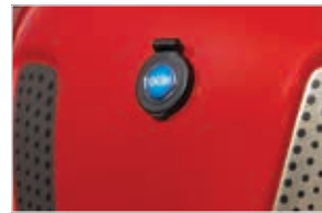
Red Rock Pearl