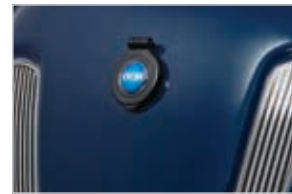
Ocean Sapphire Metallic