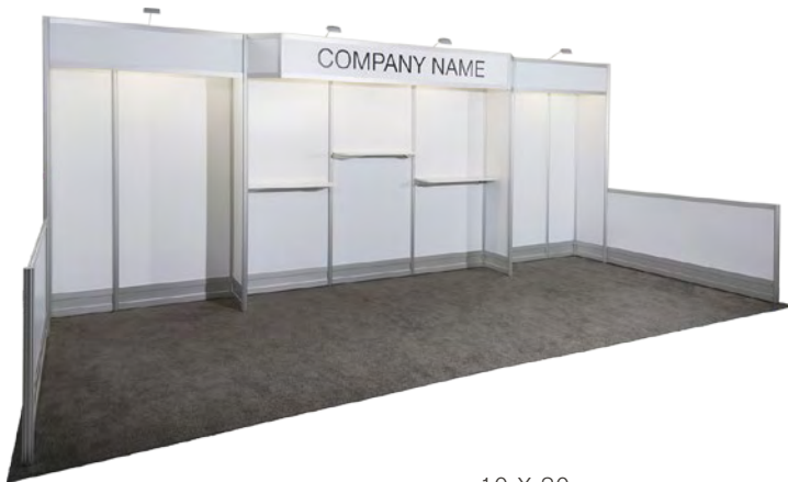
10 X 20