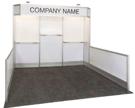
10 X 10