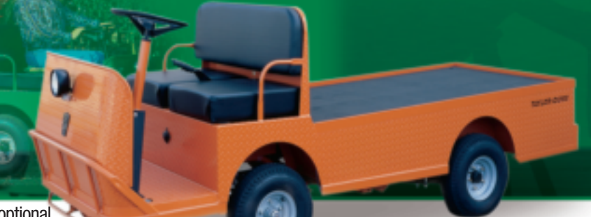
MODEL B B-248 B-248HC B-254 B-248AC B-210 EE RATED B-210 AMBULANCE

When versatility in load capacities, optional configurations, and performance is important to your operation, you need not look further than Taylor-Dunn's line of burden carriers. Taylor-Dunn burden carriers carry goods up to 5,000 lbs. and tow loads up to 17,500 lbs. With their unitized bodies, made of 16 gauge steel and an automotive differential acting as the foundation to their strength and reliability, Taylor-Dunn is the perfect answer to your material handling needs.