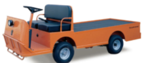
BURDEN CARRIERS "BC"