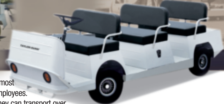
ELECTRIC TRAMS BT-280

"ET" Trams are unique solutions for the safest and most economical ways to transport your customers or employees. Equipped with T9-41 or T9-42 passenger trailers, they can transport over 30 people in a single trip. Low step height, increased visibility, and all seats facing forward make E-Tram one solution for transporting personnel. The BT-248 is designed to carry passengers back-to-back when the side-seating configuration is preferred.