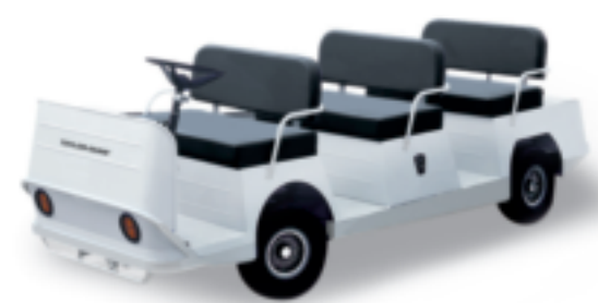
ELECTRIC TRAMS "ET"