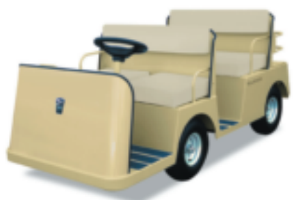
COMMERCIAL VEHICLES "CV"