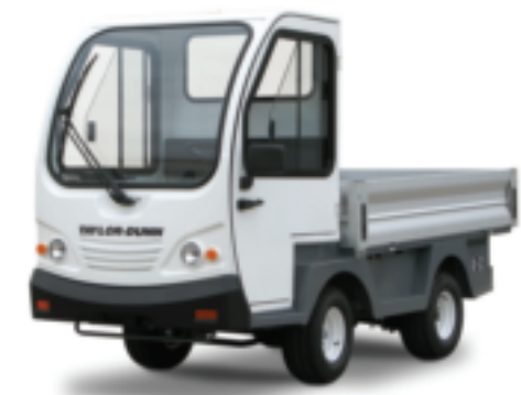
UTILITY VEHICLES "UV"