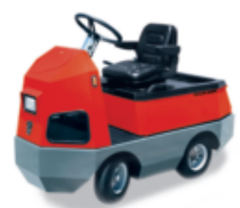
TOW TRACTORS "TT"