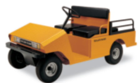
PERSONNEL CARRIERS "PC"