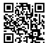
Alfa Laval Abatigo