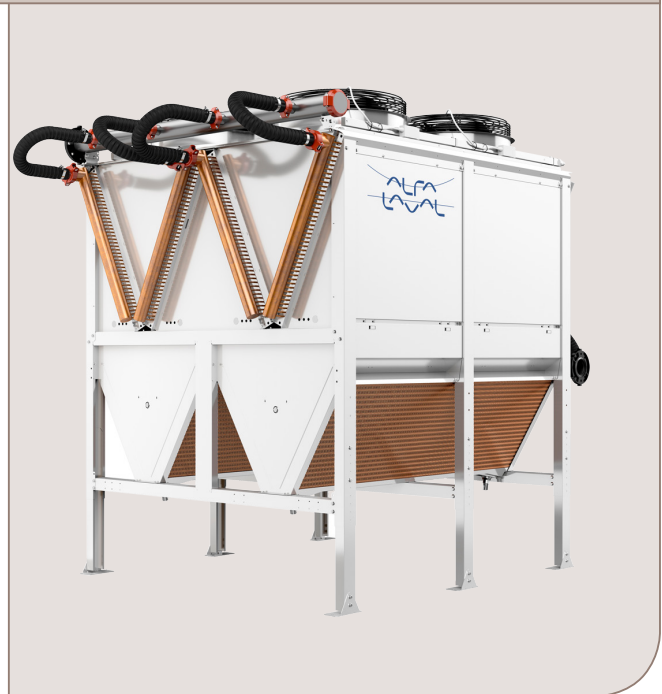
Alfa Laval Abatigo adiabatic liquid coolers