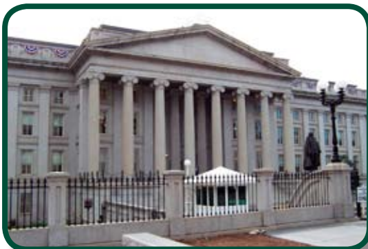
US Treasury Building