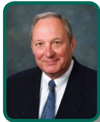
President & Co-Founder

Each installation specialist is trained in humane methods of bird control and maintains a professional profile while installing or monitoring our systems. Aesthetics, Safety and RESULTS are paramount with all Avian Flyaway services.