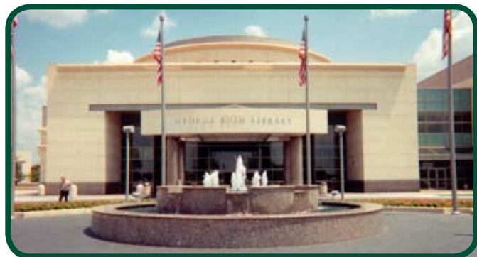
George Bush Library - Texas A&M