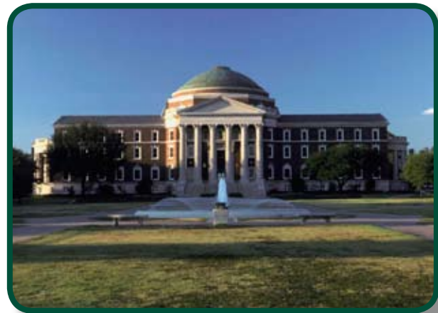
Southern Methodist University - Dallas