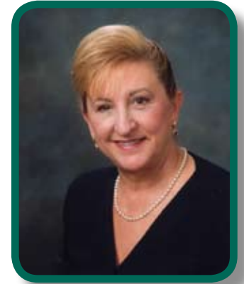
CEO & Co-Founder

The Avian Flyaway, Inc.® service area encompasses the United States, Canada, Mexico, the Caribbean and the United Kingdom. Clients include government agencies, architects, churches, property management companies, public utilities, condo associations, commercial facilities, universities, schools, and transportation companies.