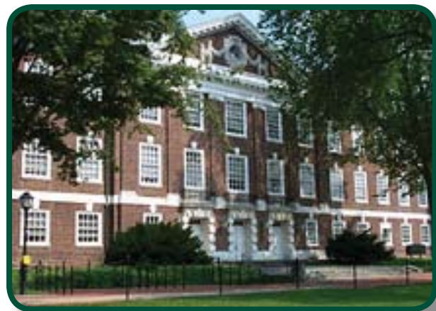
University of Delaware