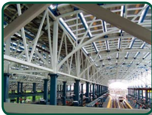
Stillwell Subway Station - New York