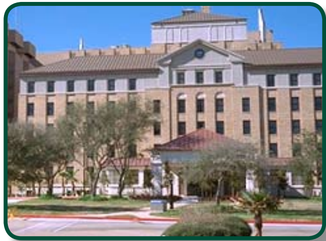
UT Medical - Galveston, TX