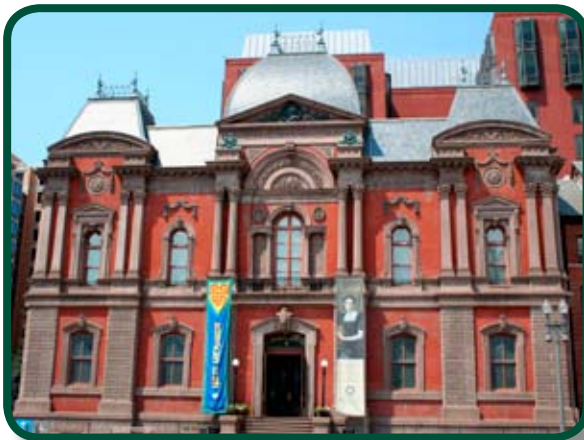
Renwick Gallery - Washington, DC