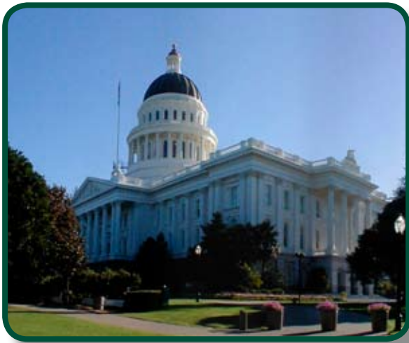
California State Capital - Sacramento