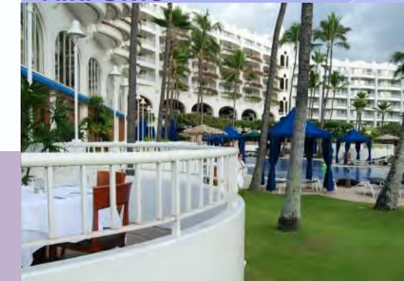
HOTELS & RESORTS