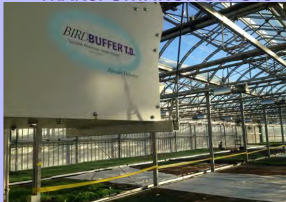
BARN & GREENHOUSES