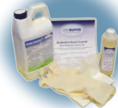
BIRDBUFFER SPRAY KIT