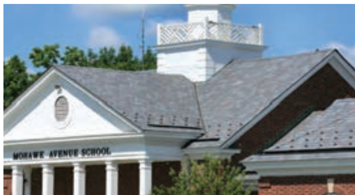
Mohawk Elementary in New Jersey, along with dozens of other schools nationwide, have selected Multi-Width Slate, European Blend due to its aesthetic appeal and 50-Year Limited Material Warranty.