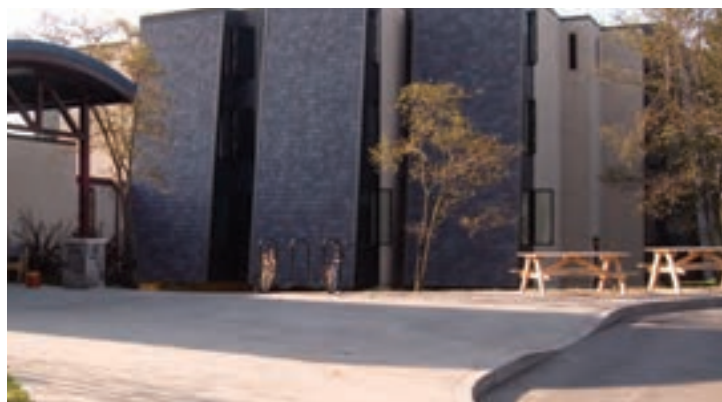
Eight residential halls at the State University of New York were re-shingled in 2009 with Multi-Width Slate, European Blend of five colors.