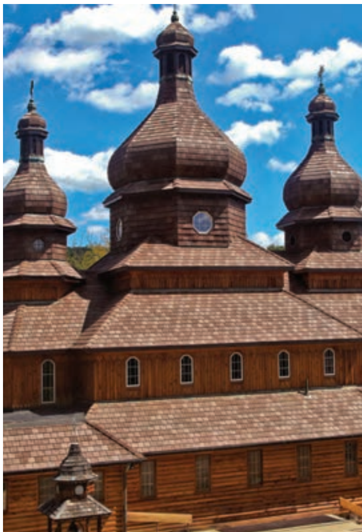
The Sacred Heart Ukrainian Catholic Church in Johnson City, NY, chose Single-Width Shake, Autumn VariBlend to complement the intricate Ukrainian design of the church.

Educational and religious institutions across the country represent many unique architectural styles and landmarks. DaVinci Roofscapes offers countless styles and color blends for practically any project, making it easier for these institutions to find the right look for their building's unique details. Best of all, DaVinci is a top-quality roofing product that features a 50-Year Limited Material Warranty, providing peace-of-mind and durability, allowing religious and educational institutions to focus on the important work they're called to do.