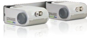
TurboFog Neo 2x2