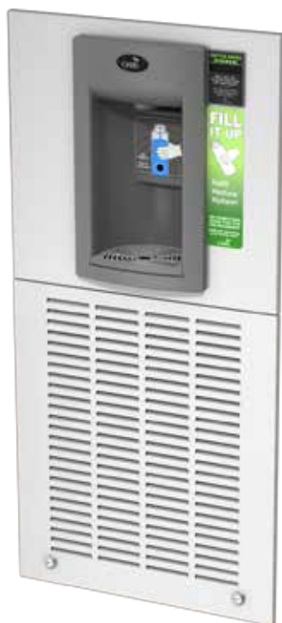
MWEBF MW8EBF MW12EBF