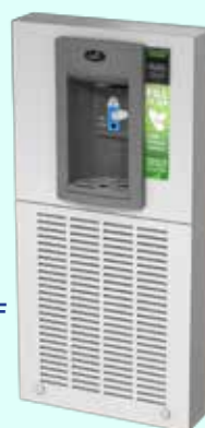
MWSM8EBF MWSM12EBF MWSMEBF