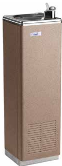
P3CP P5CP P10CP