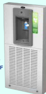
MWSMG8SBF MWSMG12SBF MWSMGSBF