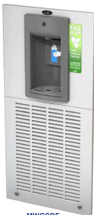
MWGSBF MWG8SBF MWG12SBF