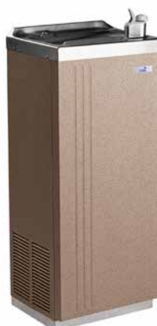
P8FA PLF8FAH P14FA PLF14FAH