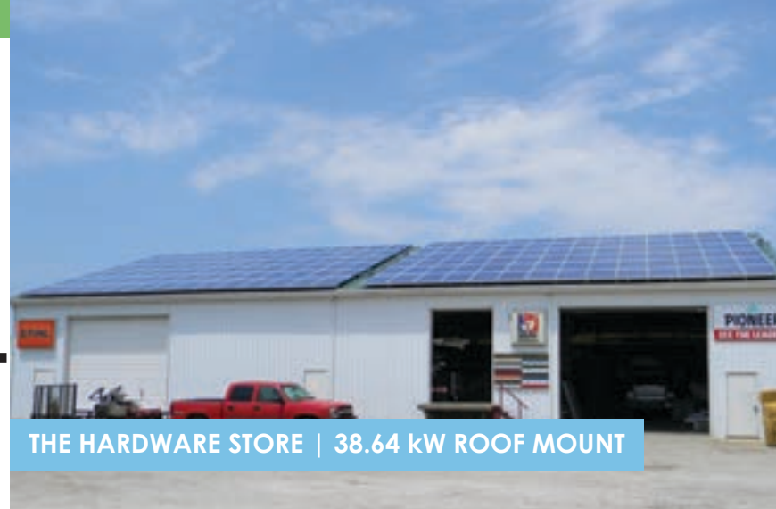
THE HARDWARE STORE | 38.64 kW ROOF MOUNT