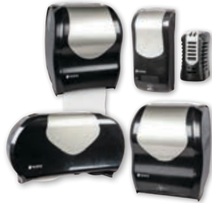
BLACK/STAINLESS LOOK - CLEAN, CONTEMPORARY SLEEK