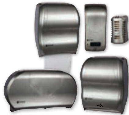
STAINLESS STEEL LOOK - HIGH END, VERSATILE, CLASSIC