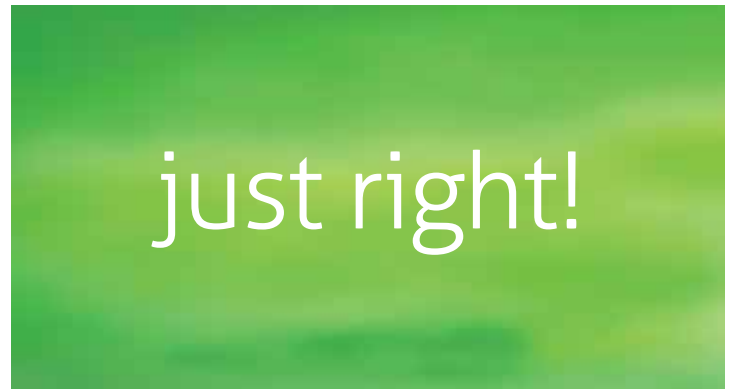
With ZOO Fans

ZOO Fans gently mix the air, eliminating hot and cold spots. The temperature at floor level is much more comfortable and the HVAC systems run less.