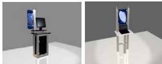
CS1* CS2* CS1 - 3' W x 1' 9" D x 6' 3" H CS2 - 2' 3" W x 1' 6" D x 6' 3" H