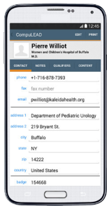
Mobile Badge Scanner