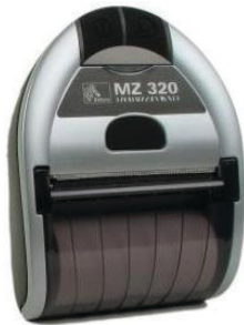
Optional Wireless Printer