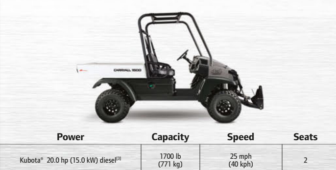
Features both our foolproof IntelliTrak<sup>™</sup> fully automatic four-wheel drive system and our IntelliTach<sup>™</sup> fully hydraulic attachment system with three attachment tools. The definition of versatility.

Tough enough to trounce rough terrain, yet nimble enough to tread lightly on manicured turf. Cockpit-style interior makes for easy entry and exit.