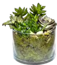
I1 7" tall x 5-6" wide $85.00 each