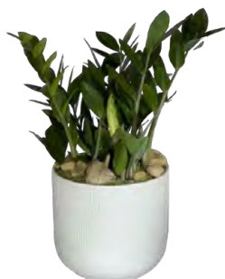
H 10-14" tall x 5-6" wide $65.00 each