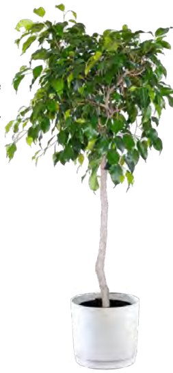
5 - 6' Ficus Tree