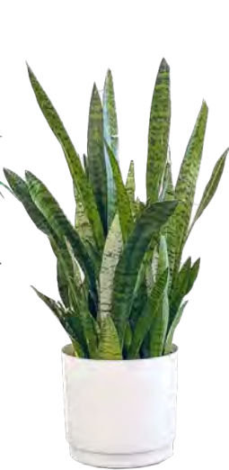
2 - 3' Snake Plant