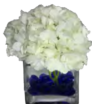
G1 6" tall x 5" wide $50.00 each