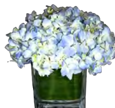
G2 6" tall x 5" wide $50.00 each