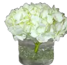
G3 6" tall x 5" wide $50.00 each