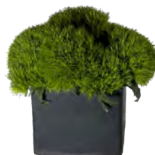
E 6" tall x 5" wide $65.00 each