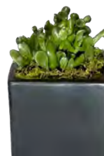
F1 6" tall x 4" wide $45.00 each