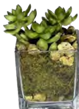
F2 6" tall x 4" wide $45.00 each