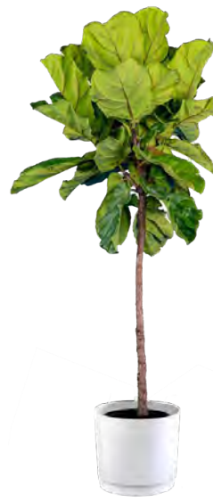
5 - 6' Fiddle Fig Tree