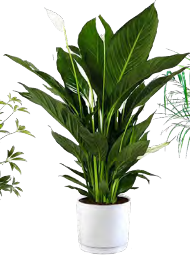
2 - 3' Spath