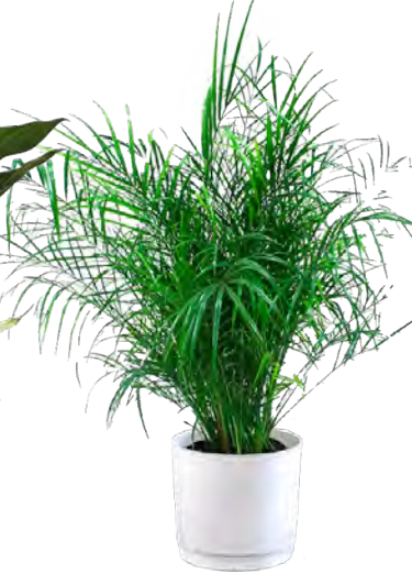
2 - 3' Palm