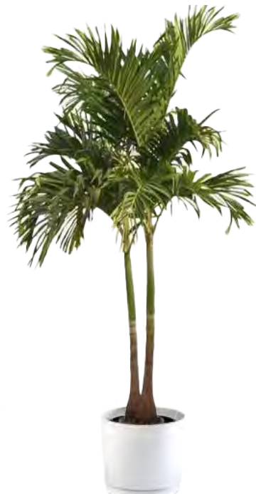
8 - 10' Andonidia Palm

*Discount pricing only applies to orders received and paid in full thirty days prior to Exhibitor Move In