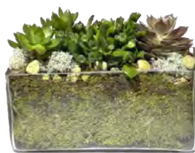
I2 7" tall x 7-8" wide $85.00 each