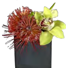
D 6" tall x 5" wide $65.00 each