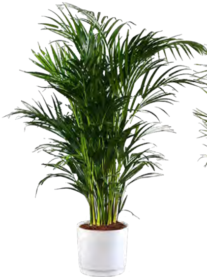
4 - 6' Areca Palm