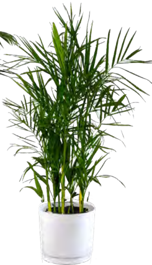
4 - 6' Bamboo Palm