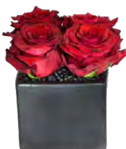
C 6" tall x 5" wide $60.00 each