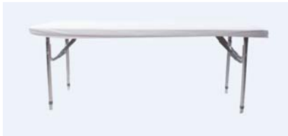
Table is delivered with plastic sheeting on top